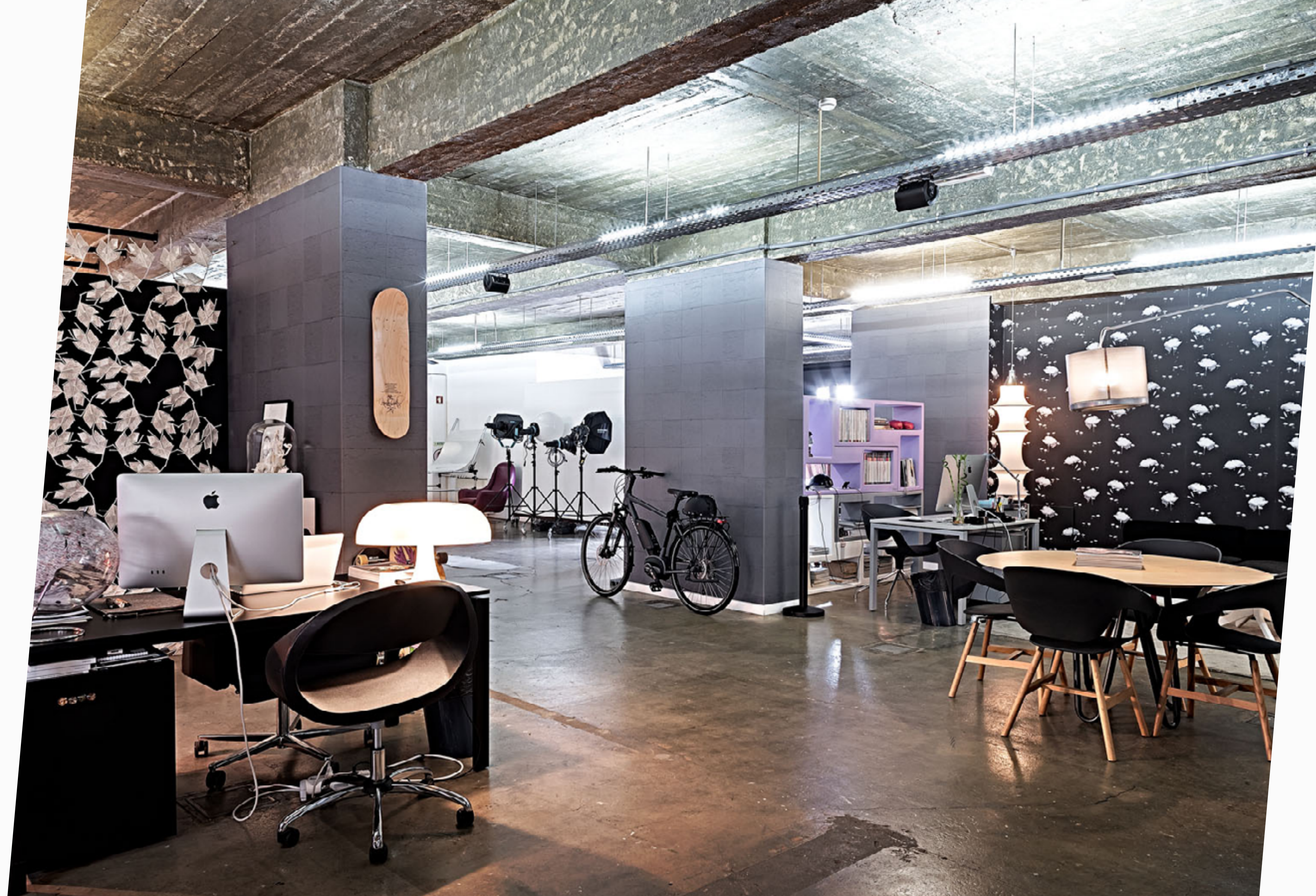
WHITE STUDIO (ENTRANCE)